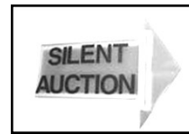
Photo Exhibit and Silent Auction

We want to remind everyone that almost all of the framed photos in our current history exhibit are available for purchase. This is a fundraiser for the church.